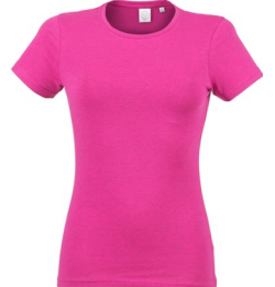
Heather Pink 682C