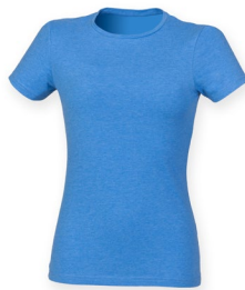
Heather Blue 2727C