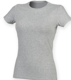
Heather Grey 34% Black