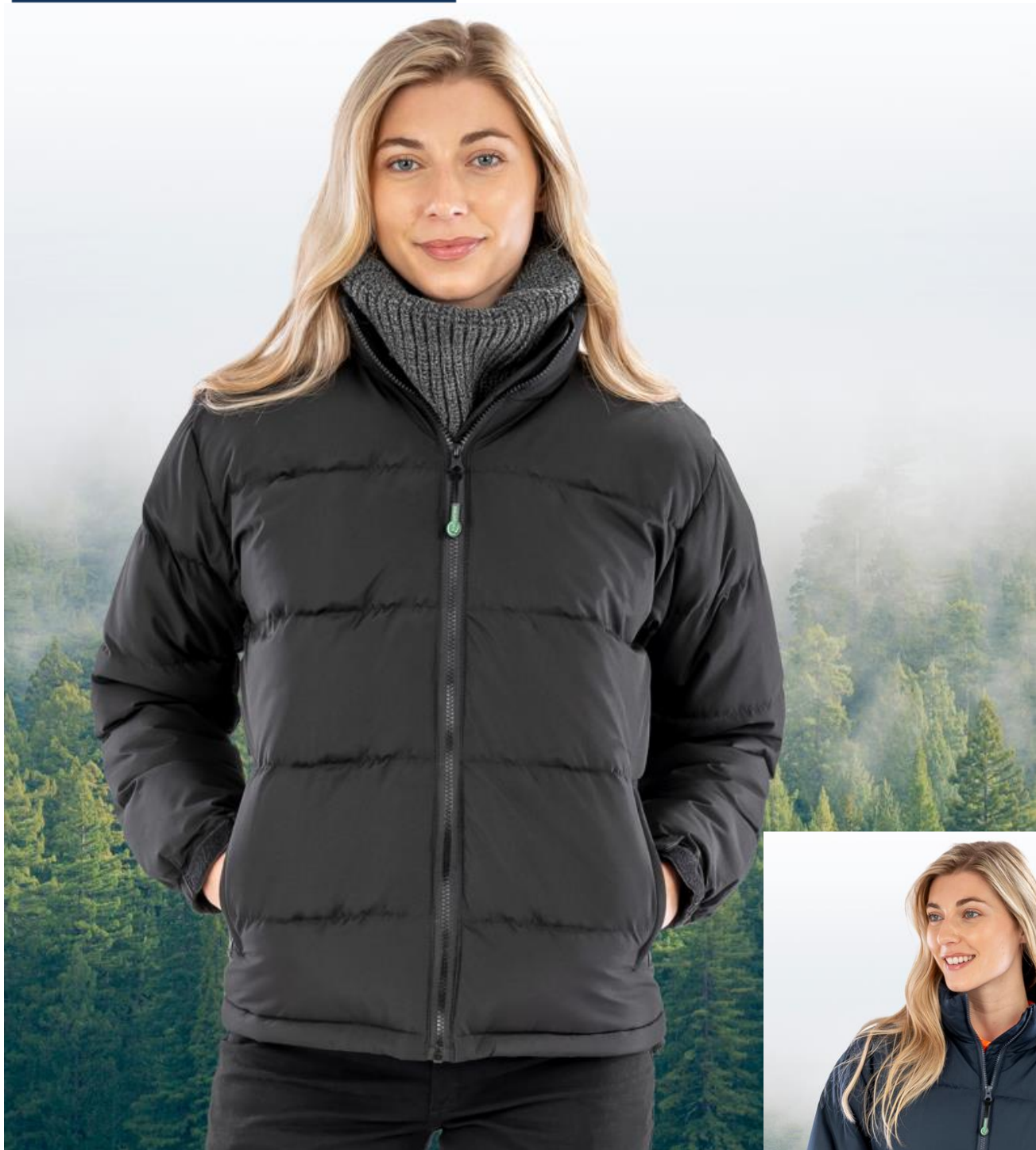
R181F WOMENS RECYCLED HOLKAM DOWN FEEL JACKET