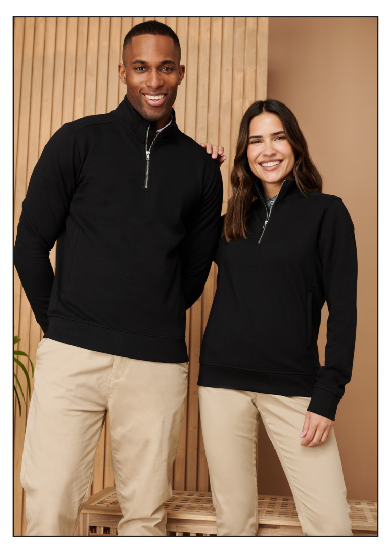
H842 Unisex Sustainable 1/4 Zip Sweatshirt